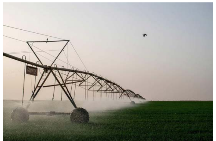
▲ Water being pumped from the Nile to GLB Invest.