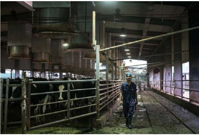
▲ Ailafoun Dairy Farm, owned by Sudan's Dal Group and the country's largest such facility, has in the past brought in foreign cows to increase production.