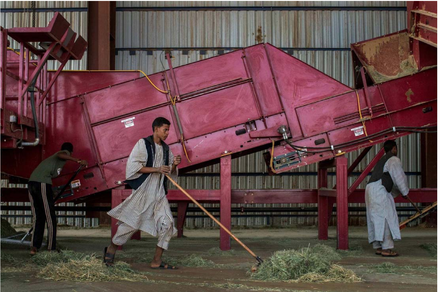
▲ Workers sweep the floor beside a hay press at GLB Invest.

▲ A center-pivot irrigation system waters alfalfa, GLB's primary crop.