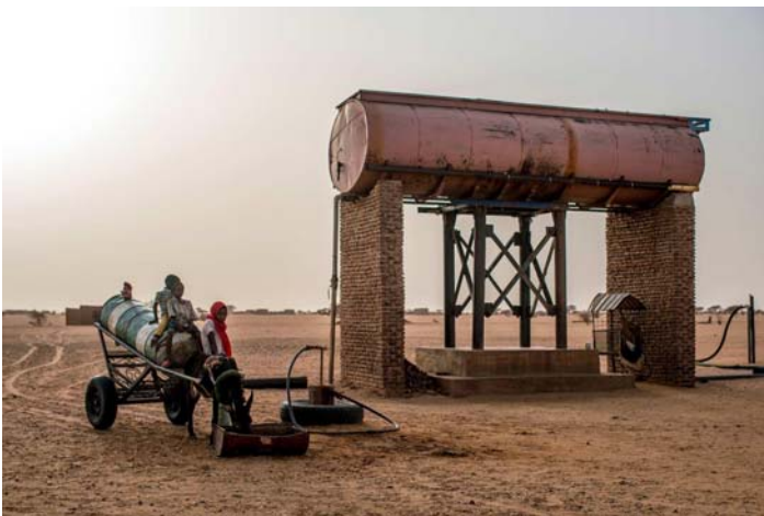
▲ A family gathers water at a tank near a farm owned by Saudi-based National Agricultural Development Co. (Nadec), outside the village of Um Saraha in North Kordofan.