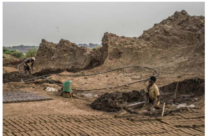
▲ Workers making bricks in Jerif, outside Khartoum. Locals have protested the confiscation by the Sudanese government of some riverfront used for brick kilns and small-crop cultivation.