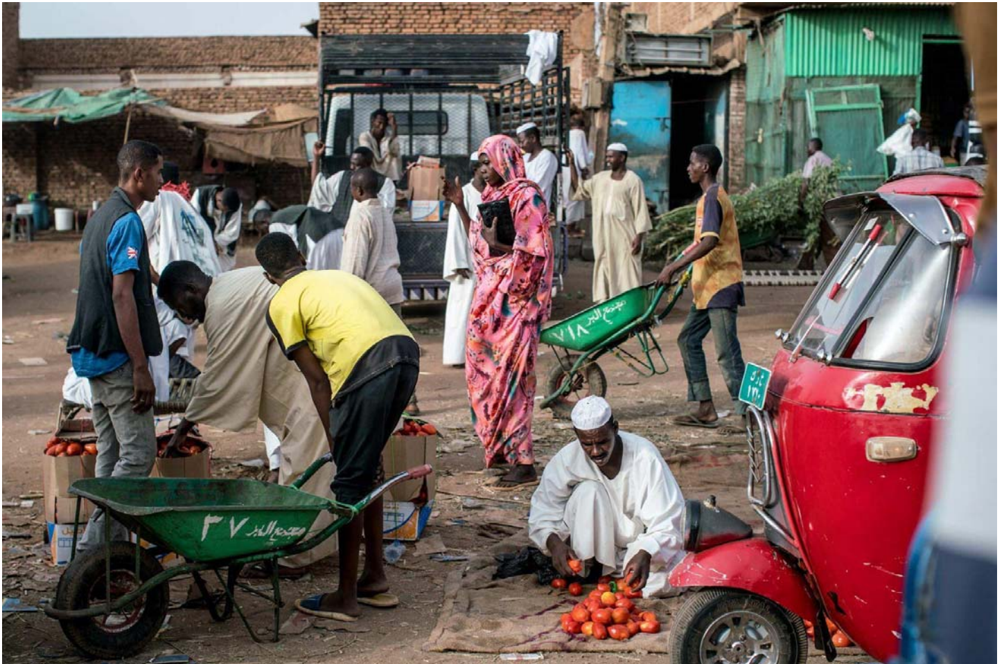
▲ Souq al-Shabi, a Khartoum market where sellers hawk livestock, fruit, and vegetables.