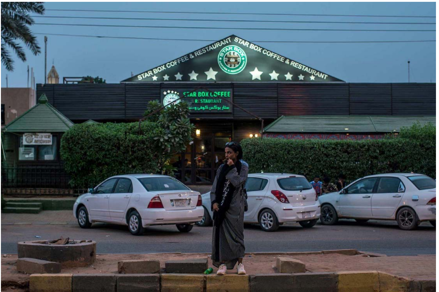
▲ A woman crosses the street in front of Star Box Coffee & Restaurant, a Starbucks knockoff in Khartoum.

The effort may yet pay off, but early signs augur ill. Many Sudanese describe the plan as little more than a naked land grab that's depriving them of their ancestral fields while enriching the government and a foreign corporate elite. The anger has spread from villages to cities, becoming part of a larger uprising—the so-called Revolution of the Hungry —that constitutes the gravest threat to Bashir since he seized power. Protests triggered in part by soaring bread prices have taken place in more than 30 cities and towns since mid-December, and at least 50 people have been killed. The unrest shows no signs of abating. As one farmer from Gezira state, not far south of Khartoum, told me, “We’ll protest until we’re dead or we get our way.”