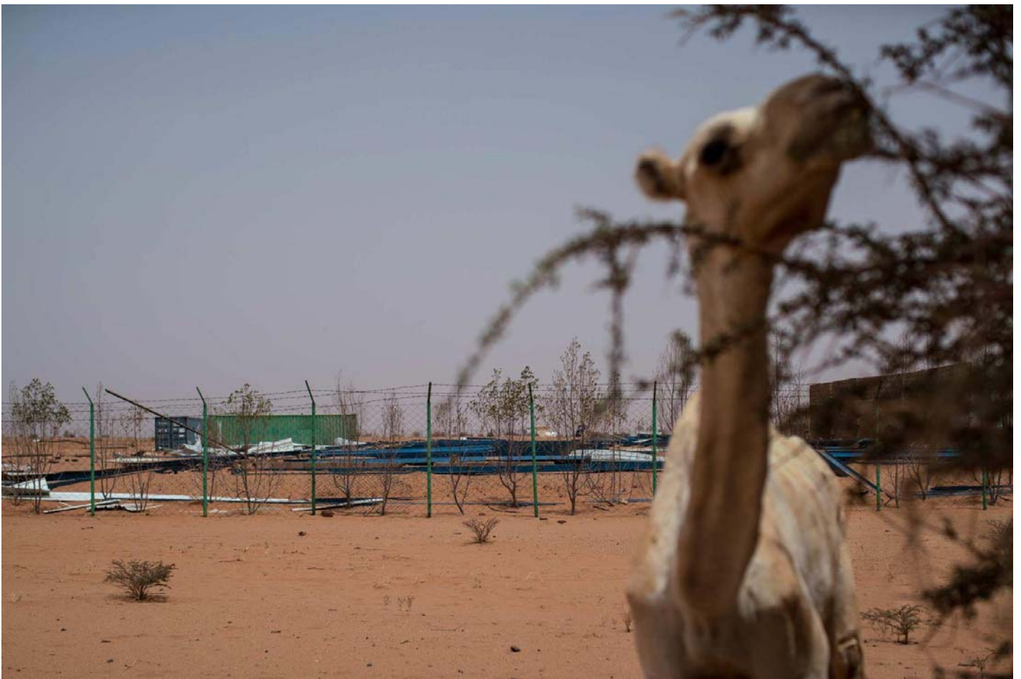
▲ Dried-out farmland owned by Alrawabi for Development, a Saudi-Yemeni firm that overpumped the aquifer under the property.